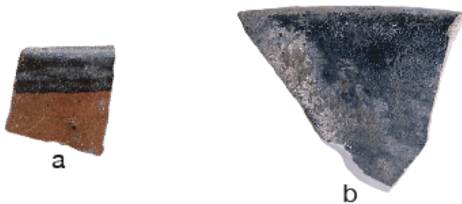
Figure 2. Spanish Colonial ceramic sherds from the Morris Ranch site in Atascosa County, Texas: a, Smooth Brown rim sherd; b, Black Luster Glaze rim sherd.